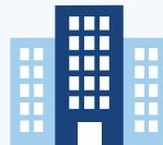
Office and Government Buildings