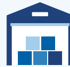
Warehouse and Industrial